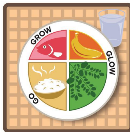
Figure 1. Pinggang Pinoy

Pinggang Pinoy is a food plate guide that will help guide Filipinos on what kinds of food and the recommended proportion consumed per meal. According to the Pinggang Pinoy , one's plate per meal should consist of Go (rice, bread, corn, oats, sweet potatoes, etc.), Grow (fish, egg, legumes, chicken, meat) and Glow foods (vegetables and fruits) in the right portions (See Appendix for portions of food recommended per age or population group). One's plate should look like the image below: